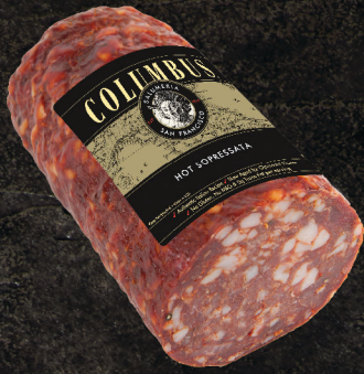
HOT SOPRESSATA 83583

Coarsely chopped and mixed with flavorings of chile de arbol, fennel and sherry wine.