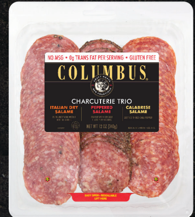
CHARCUTERIE TRIO 83872

Made from the premium center cut of leg meat that is gently massaged with a hint of salt and then placed in aging rooms for the slow drying process.