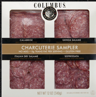
CHARCUTERIE SAMPLER 4 CT. 83886

Made with crushed white and black peppercorns and burgundy wine. Hand-tied and slow-aged in a natural casing that gives it a subtle, smooth flavor.