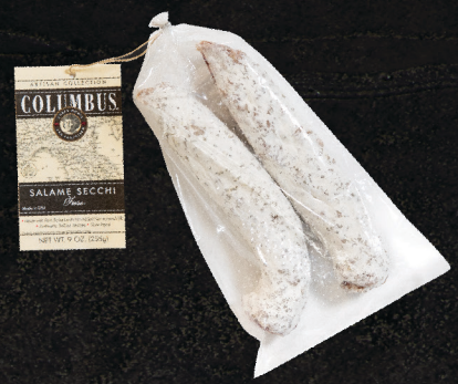
SALAME SECCHI - 2 PACK 83836

Robust with sweet fennel, red peppers and red wine, our Sopressata is every bit as authentic as the varieties that were made centuries ago.